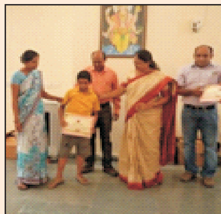
Adtl . Director felicitating a differently able child for painting competition