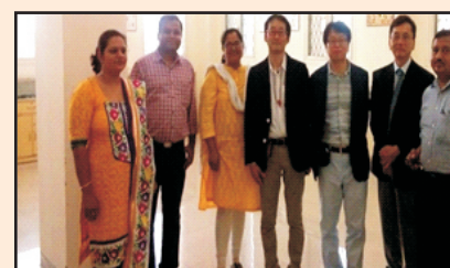
Japanese Delegation with experts of Shalakya Dept.