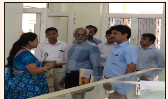
GGSIPU Academic audit visitation team during inspection in Dravyaguna Dept. of institute