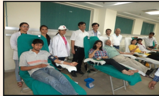
A view of Blood Donation Camp organized at CBPACS in collaboration with Rotary Club, Ghaziabad members who donated blood. The blood donors told that the experience was like lighting a candle in someone's life.

A Blood donation camp was organized in the Hospital campus in collaboration with Rotary Club Gzb. on April 23, 2014. It was a huge success with 102 volunteers including many students & staff