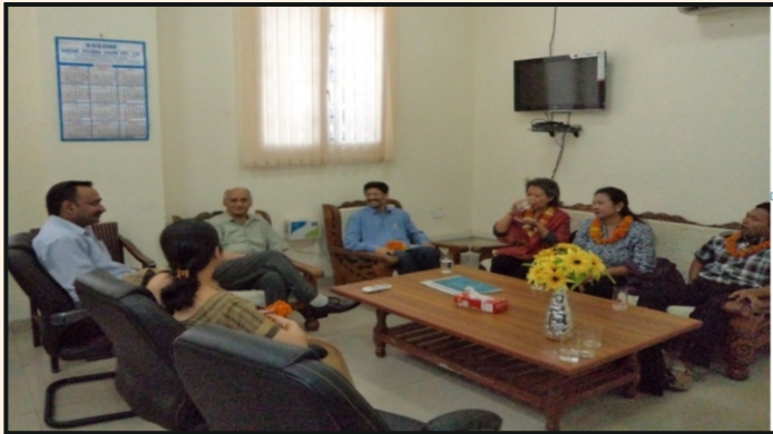
Indonesian Delegation in informal discussion with Director- Principal

A six member delegation from University of Hindu, Indonesia visited CBPACS on April 2, 2014. They interacted with faculty members & explored different branches of Ayurveda flourishing in the Hospital. They were apparently delighted to see such wonderful institute of Indian System of Medicine.